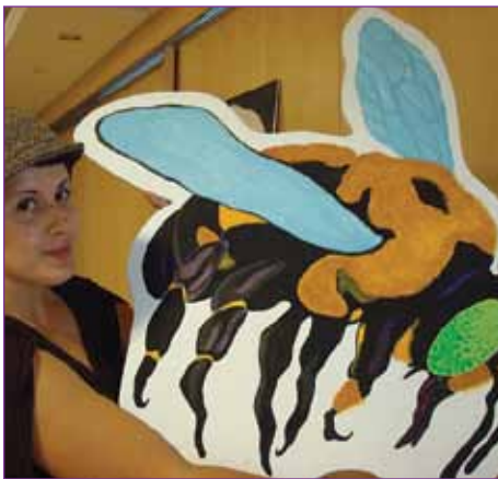
off the wall mural program: p 3

scarborough arts COMMUNITY CULTURE CONNECTION