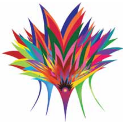
kaleidoscope: pg 4