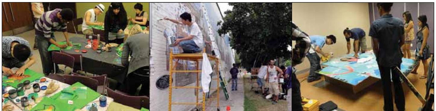
Participants learn ( L-R): Stenciling, Mural Restoration, Panel Installations.