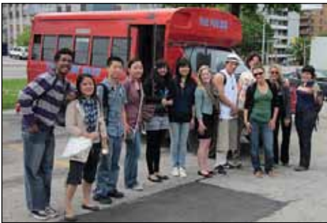
Off the Wall participants

How students entered this program varied. Some had worked with Mural Routes in the past or were going to work with them. How I learned about the program differed. I received an invitation to apply to the program from the Community Arts Program (CAP) at York University, certificate program linking Fine Arts and Environmental Studies.