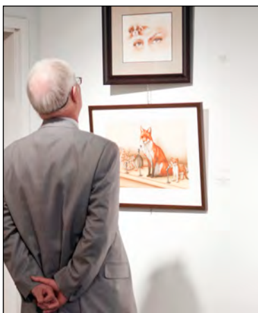
Pondering the work.