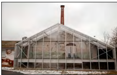
The show was held at the beautiful Papermill Gallery (Todmorden Mills, 67 Pottery Rd), March 31 - April 17.

April 2011 featured one of the most spectacular SA juried shows to date. 67 artists were featured at eccentricities, an exhibition celebrating the quirks of the artistic spirit. The opening reception on March 31 (shown in photos below) featured a packed house and an awards presentation.