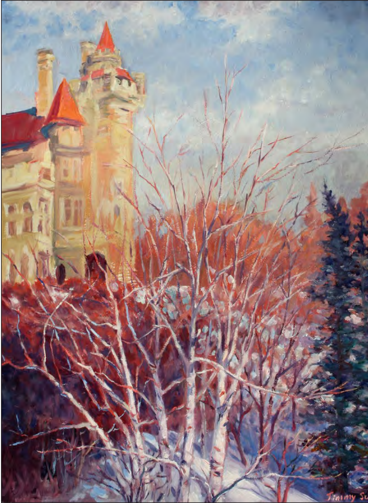
Casa Loma, Toronto, Ontario