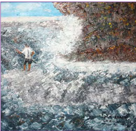
Malcolm Leach: pg 3

scarborough arts COMMUNITY CULTURE CONNECTION