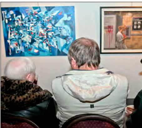
Eccentricities: pg 4