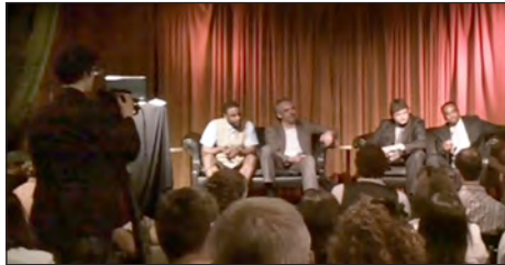
Panelists at the Graffiti Summit Town Hall.

Advocates for the art of graffiti touched its historical aspects, the importance of unbridled socially conscious messaging and protecting our freedom of expression rights. They