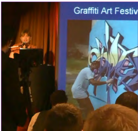
to graf or not to graf: pg 3

scarborough arts COMMUNITY CULTURE CONNECTION