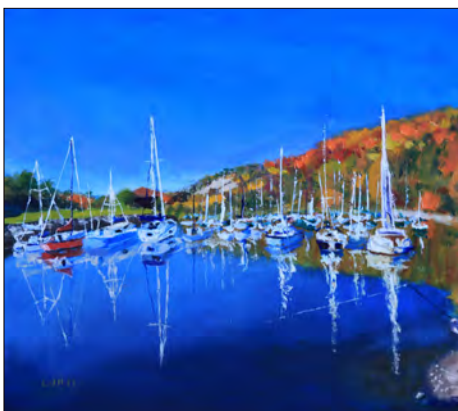
members' gallery: pg 5