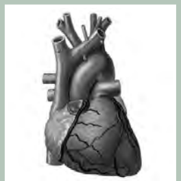
Artery page 8