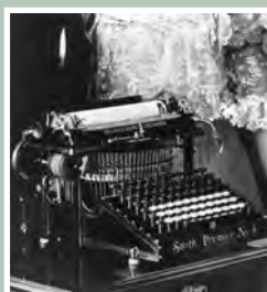
Writers Month Winners page 4