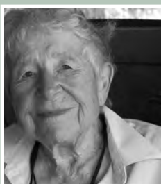
Farewell Doris page 2

a publication of SCARBOROUGH arts COUNCIL